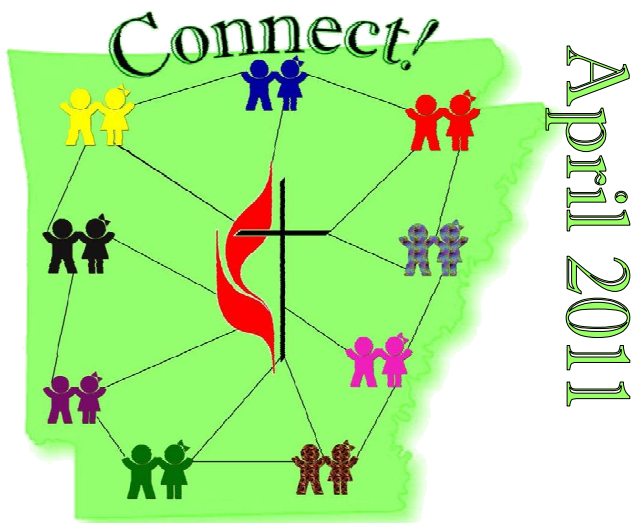
A newsletter for people serving in children's ministry in the Arkansas Conference of the United Methodist Church.